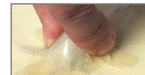
Grip & Seal