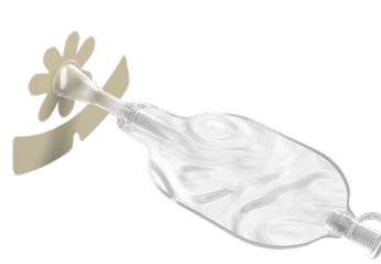
Men's Liberty™ with drip chamber