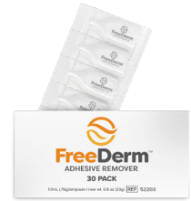
FreeDerm™ Adhesive Remover Instantly removes hydrocolloid without irritation.